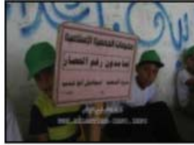
Summer camp

Appearing to confirm the UG's support of Hamas, Khaled Mishal, head of Hamas' political bureau in Damascus, was reported in 2007 to have thanked UG leader Youssef Qaradawi, whom he said: