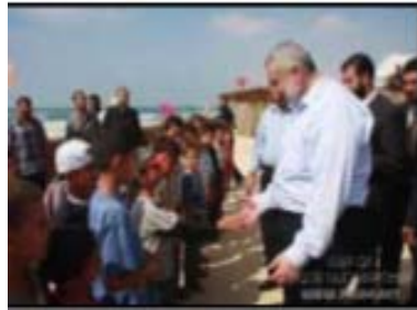
Ismail Haniya

The ITIC also provides photos of UG-funded summer camps including Hamas Prime Minister Ismail Haniya visiting one such a camp in Gaza, and a camp group named after shaheed (martyr) Ismail Abu Shanab, one of the Hamas leaders in the Gaza Strip, who was killed by Israel in August 2003. 150