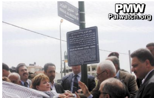
[Al-Ayyam, April 21, 2010]